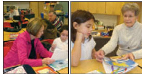
Students get help with homework